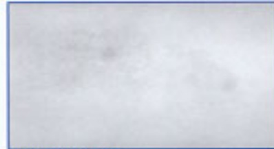
SCHRINKAGE mark CC4