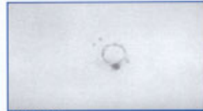
INSERT mark F