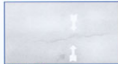
HOT TEAR mark E