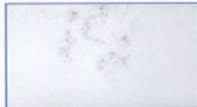
SCHRINKAGE mark CB4