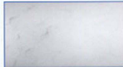
SCHRINKAGE mark CA4