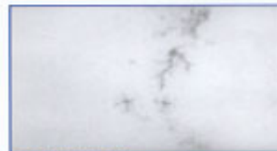
SCHRINKAGE mark CD4