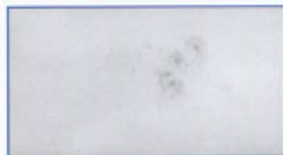
SCHRINKAGE mark CD3